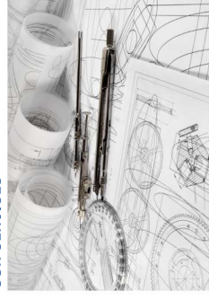
ENGINEERING AND DESIGN